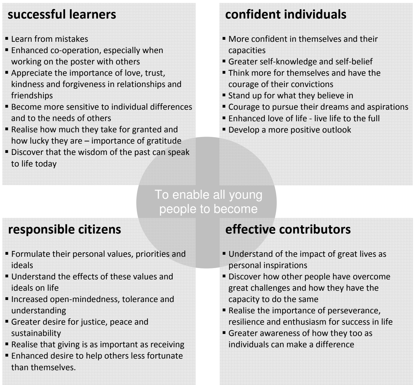
Figure 1: The values poster awards learning outcomes

The Values Poster Award makes a significant contribution to the aspirations of A Curriculum for Excellence and is mapped in to the four capacities at its foundation. There can be few other programmes that provide teachers with the opportunity to bring these aspirations alive. Taking part in the programme is an excellent opportunity to showcase the work you are doing to develop the four capacities.